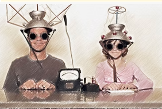
Parenting in an Online World 101

These beautifully designed, educational books cover physical, mental, emotional, and spiritual health , with titles available for all ages - from preschoolers and primary school children through to teenagers & adults . They make wonderful additions to a home library and/or thoughtful gifts for Christmas and beyond.